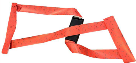
Unravelled Insect Inn Ultra II Cartridge